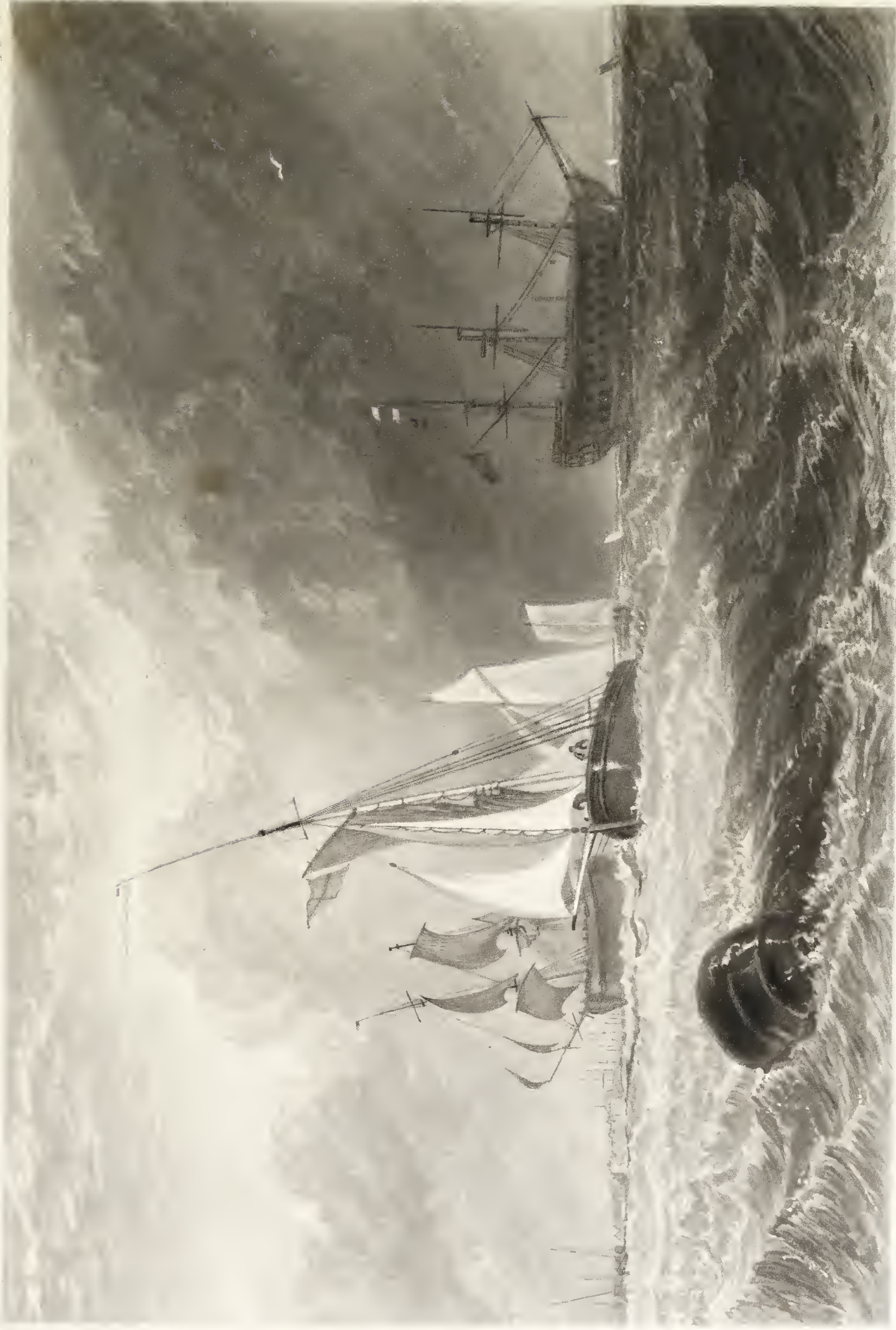
Pl. 6. The Lupton